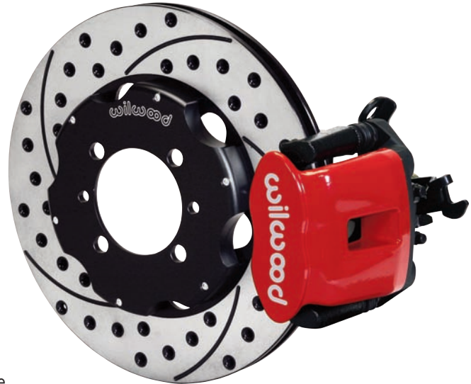
Combination Caliper Rear Parking Brake Kit with SRP Rotor Down Load High Resolution Photo, click here