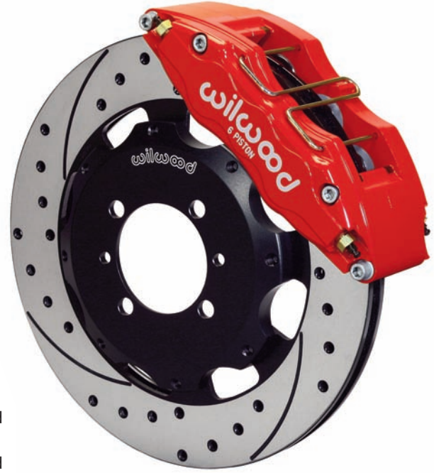
Front Kit with SRP Rotor and Red Caliper Download high resolution photo, click here